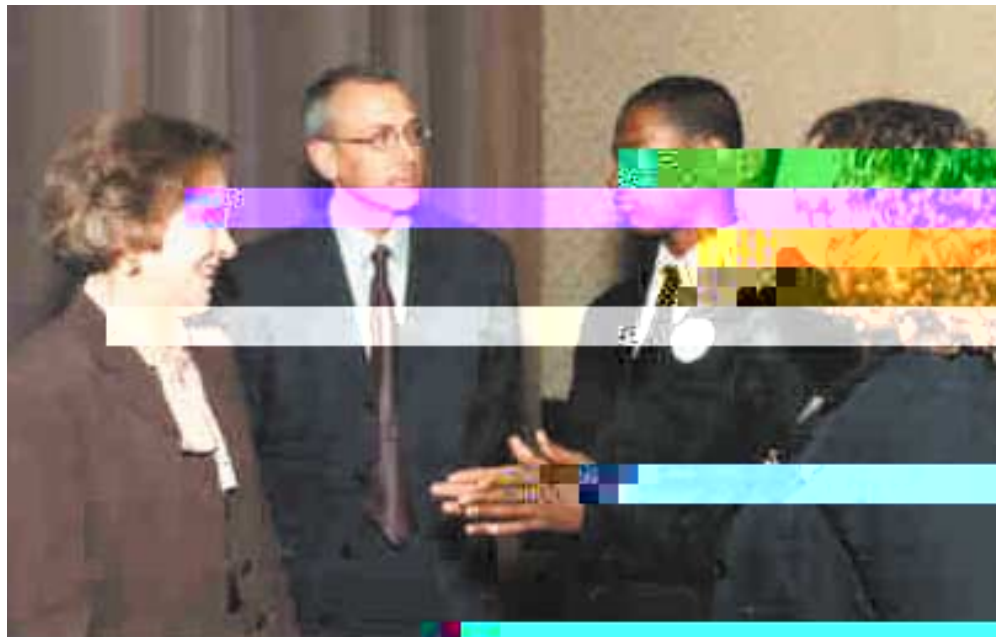
Youth participants at the Rosalynn Carter Symposium on Mental Health Policy share their stories with the former first lady and national radio talk show host Dr. Drew will contal illness to con creath