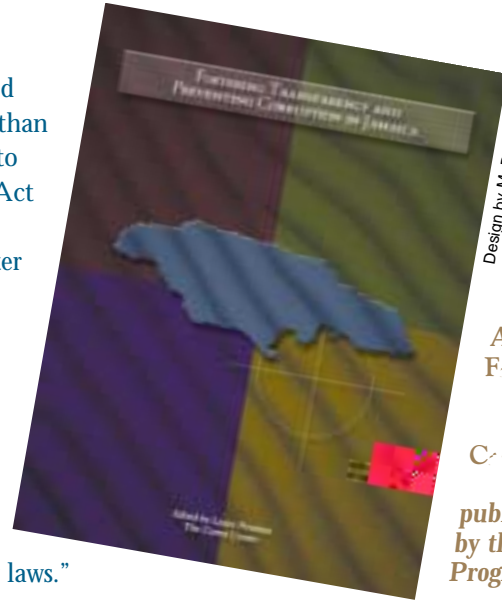
Design by M. B. Robertson

"The Parliament debated for eight months, and more than 40 amendments were made to the Corruption Prevention Act in order to strengthen it — many suggested by The Carter Center," Neuman said. "We will continue our partnership with the government, the Jamaican Media Association, the private sector, and civil society groups to ensure effective implementation and enforcement of the new laws."